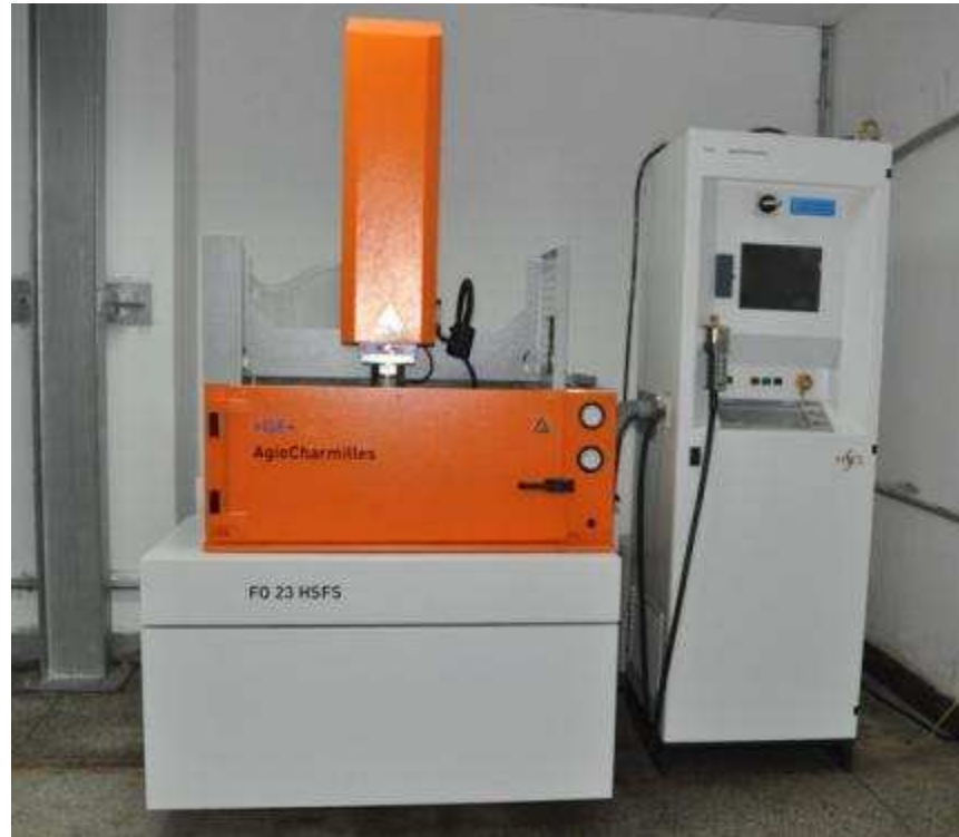
Charmillie Model: F0 HSFS, Mirror E.D.M