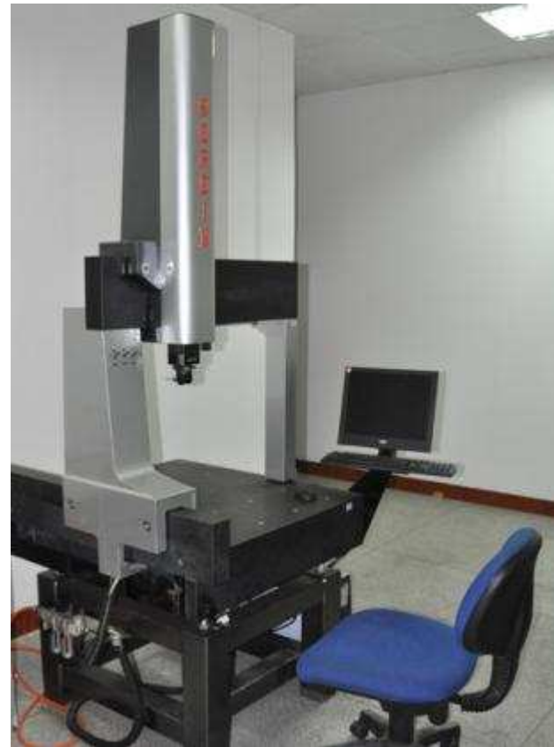
3D Programmable CMM